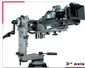
3 rd axis